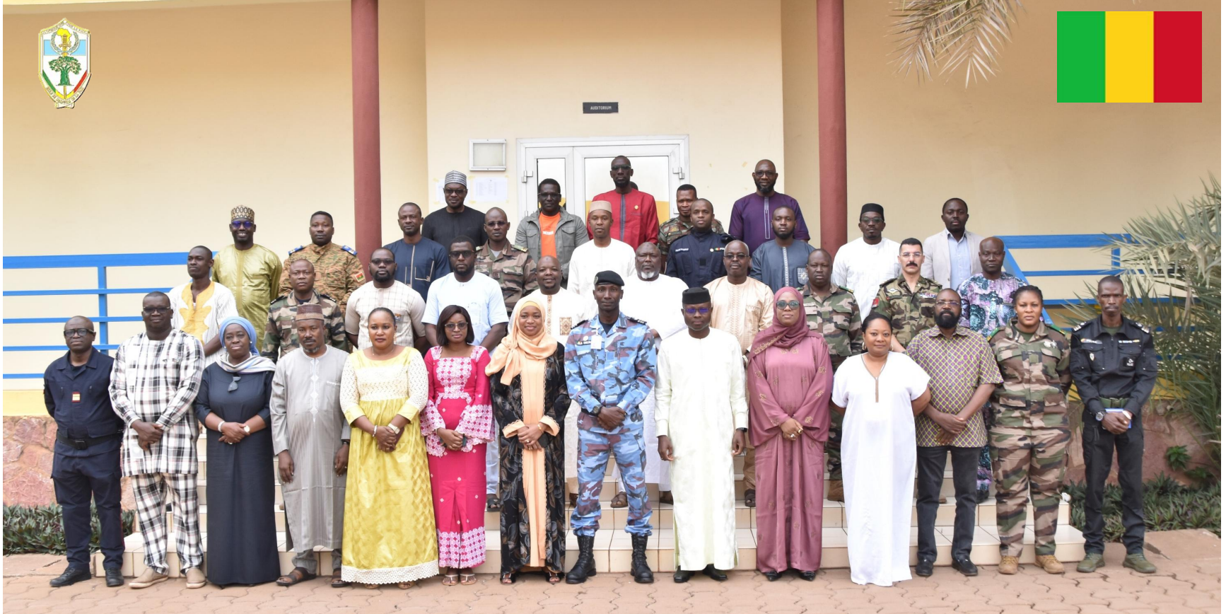
Training of Trainers (TOT 1-25 ML ) EMP-ABB From 13 to 24 Jan 2025