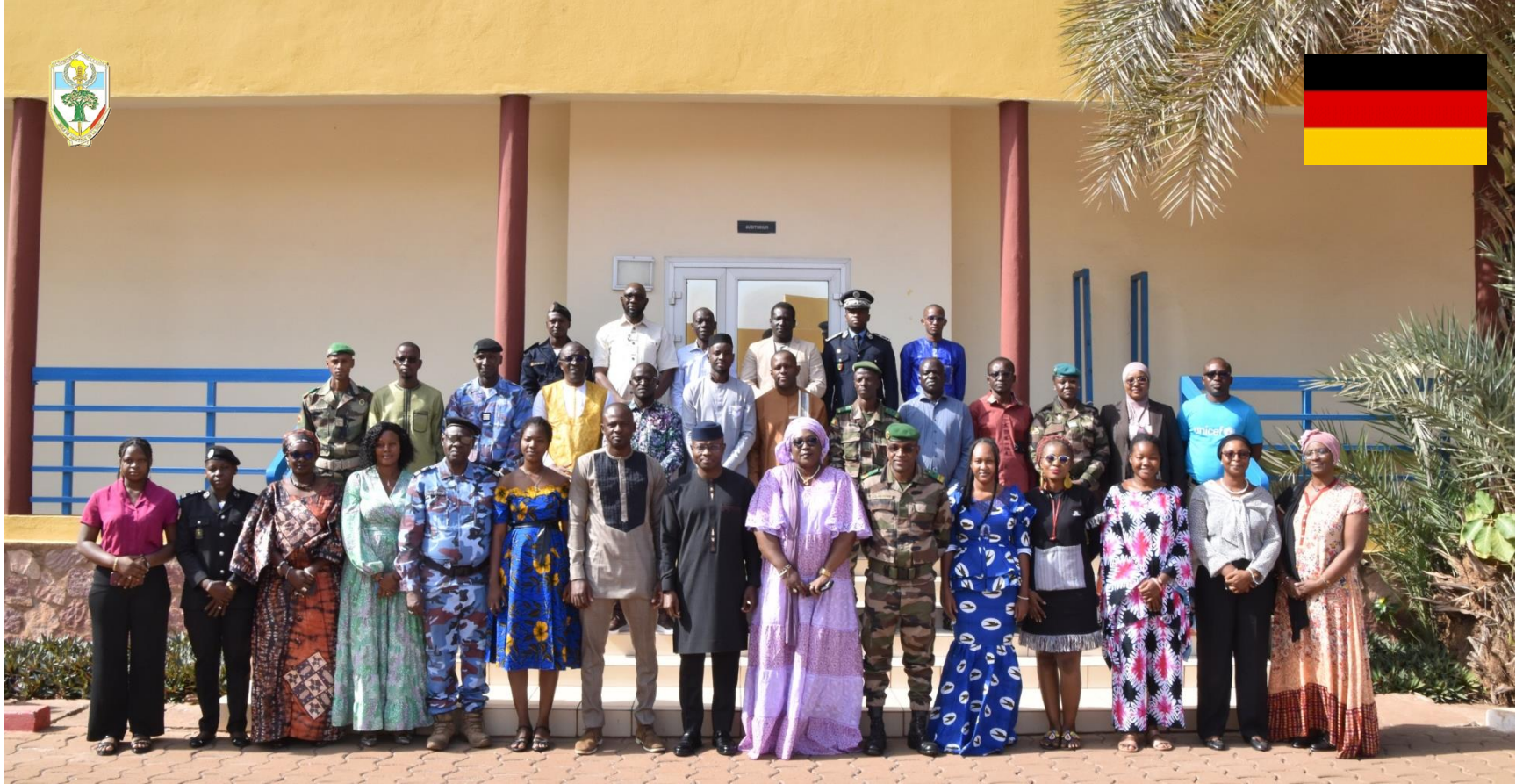
United Nations Civil-Military Coordination (UN-CIMIC) EMP-ABB