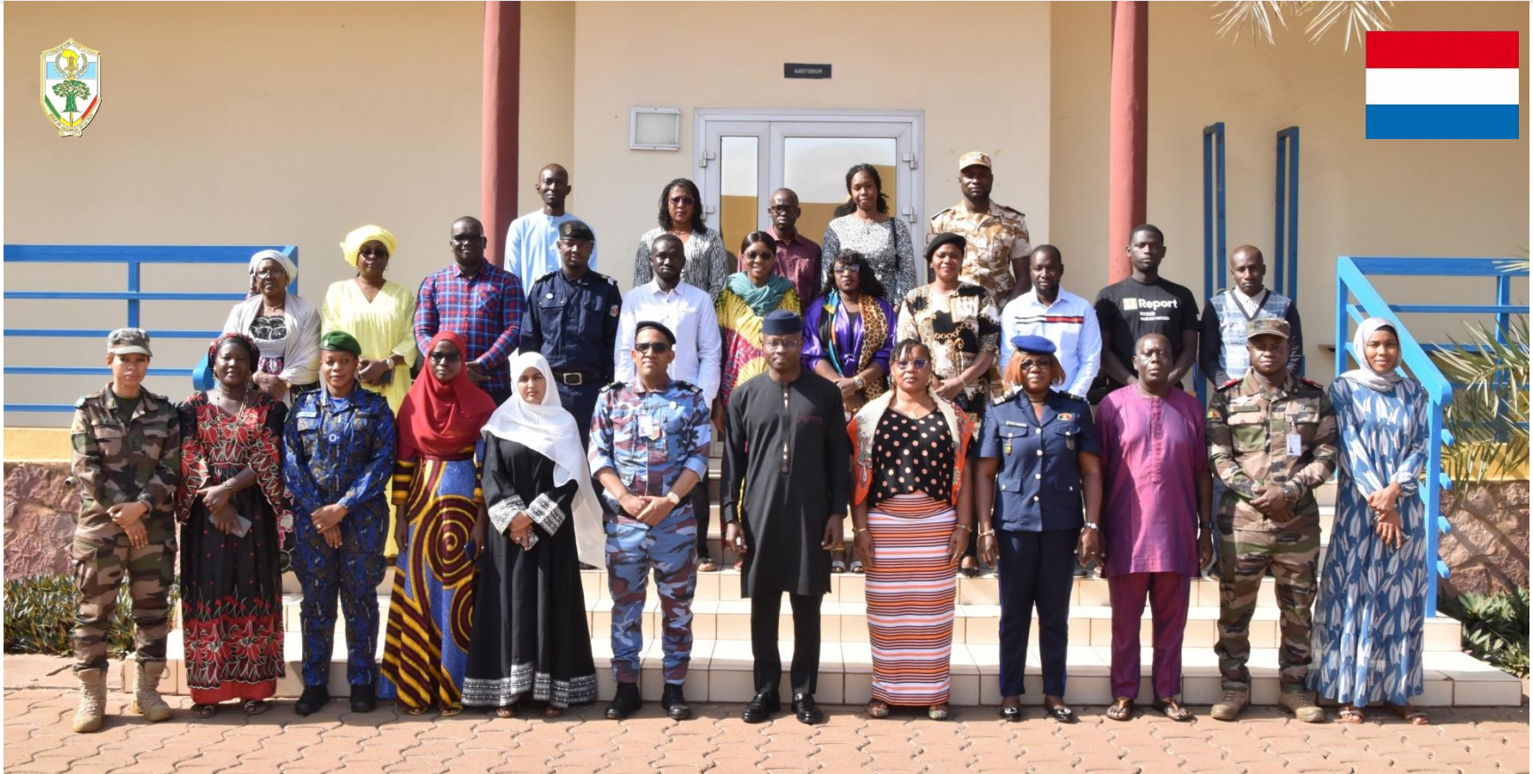
Children's rights and protection (DPE) EMP-ABB 02 - 13 December 2024