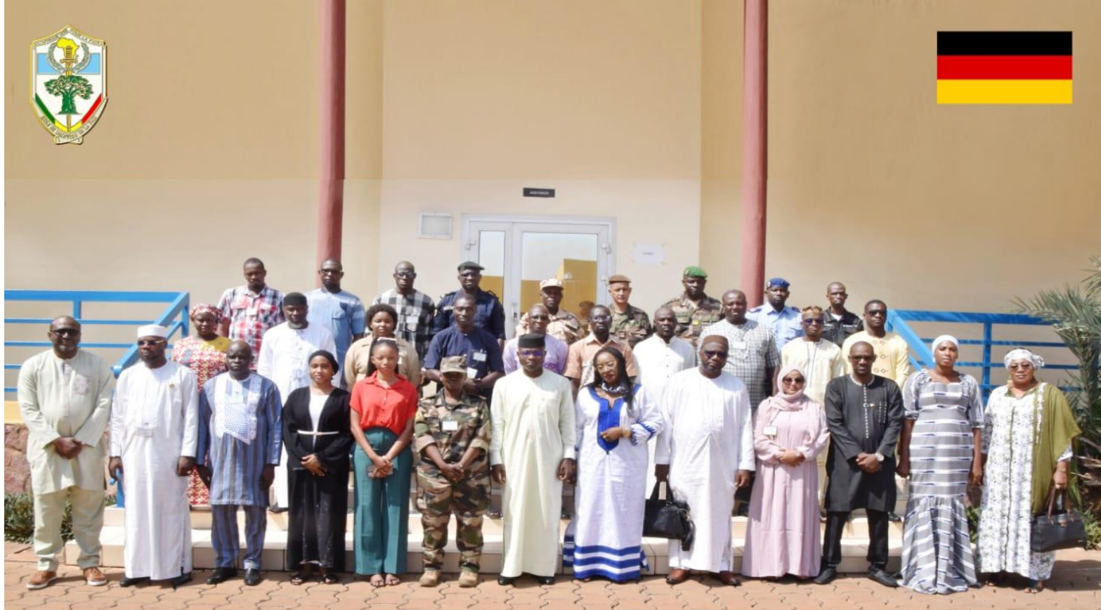
Peacebuilding (CONS-PAIX) EMP-ABB September 23 - October 04