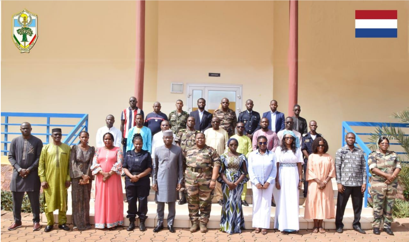
International Humanitarian Law (DIH) EMP-ABB 07 - 18 October 2024