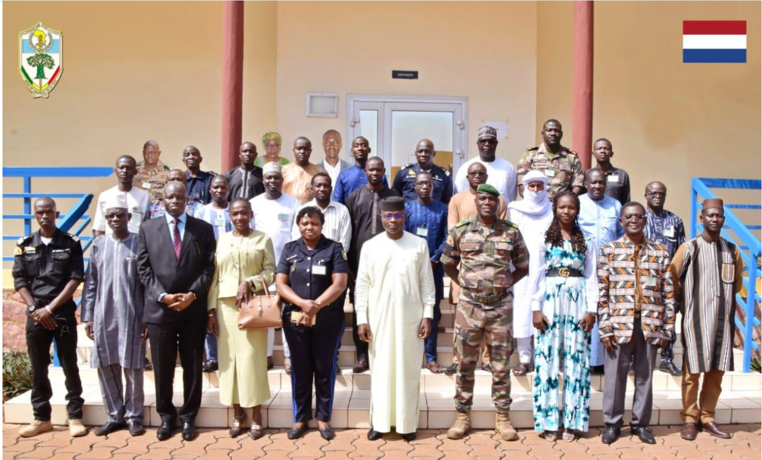
Security Sector Reform Level 2 (RSS 2) EMP-ABB September 23 - October 04