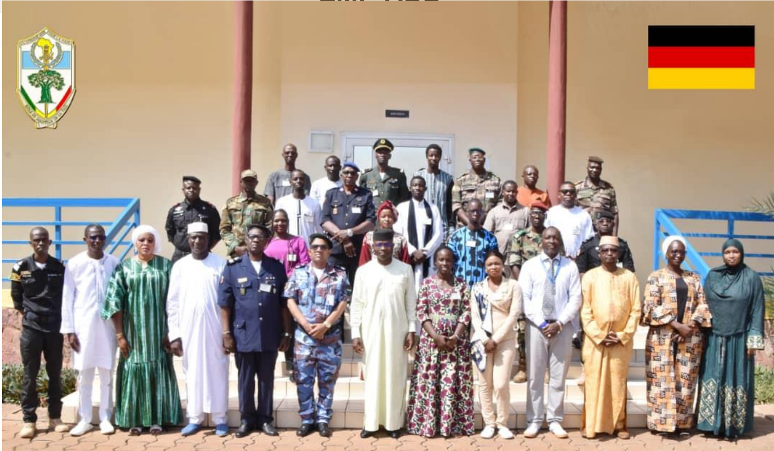
Protection of civilians (POC) EMP-ABB September 23 - October 04