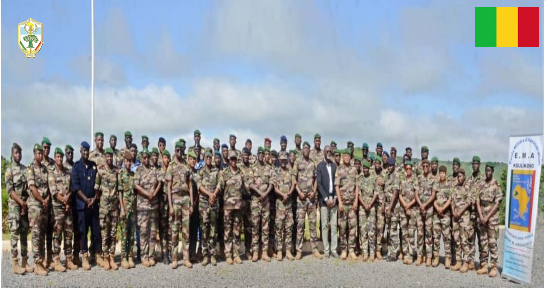
United Nations Logistics - UNLOG 2-24 KATI