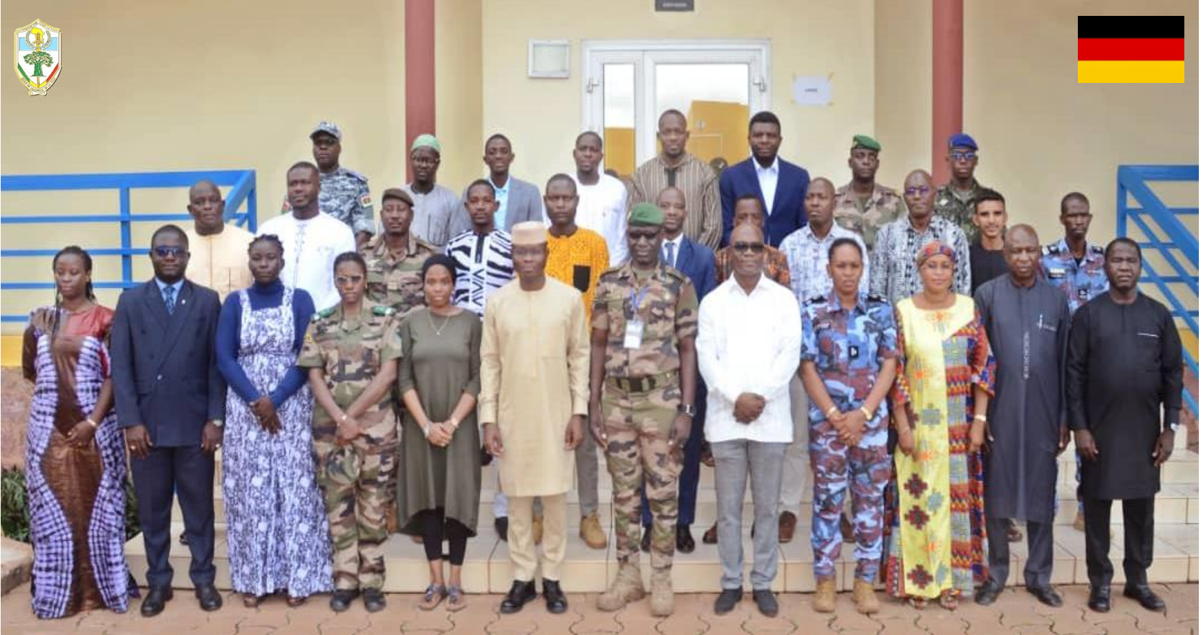
Human rights - DH 2-24 EMP-ABB 02 - 13 September 2024