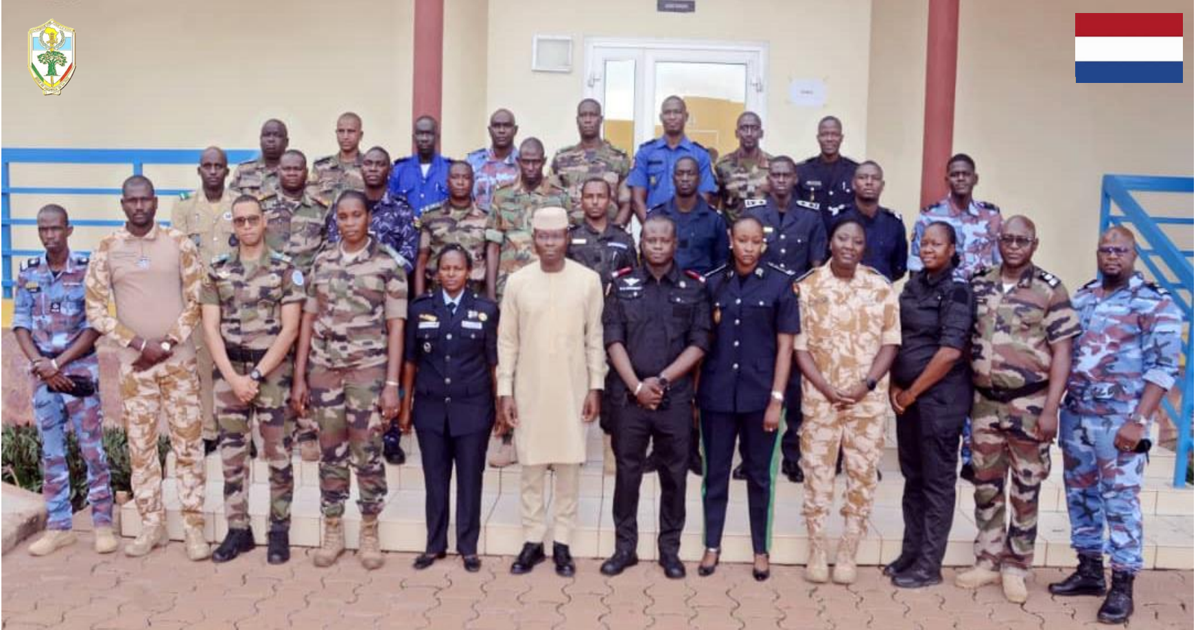
United Nations Police - UNPOL 5-24 EMP-ABB