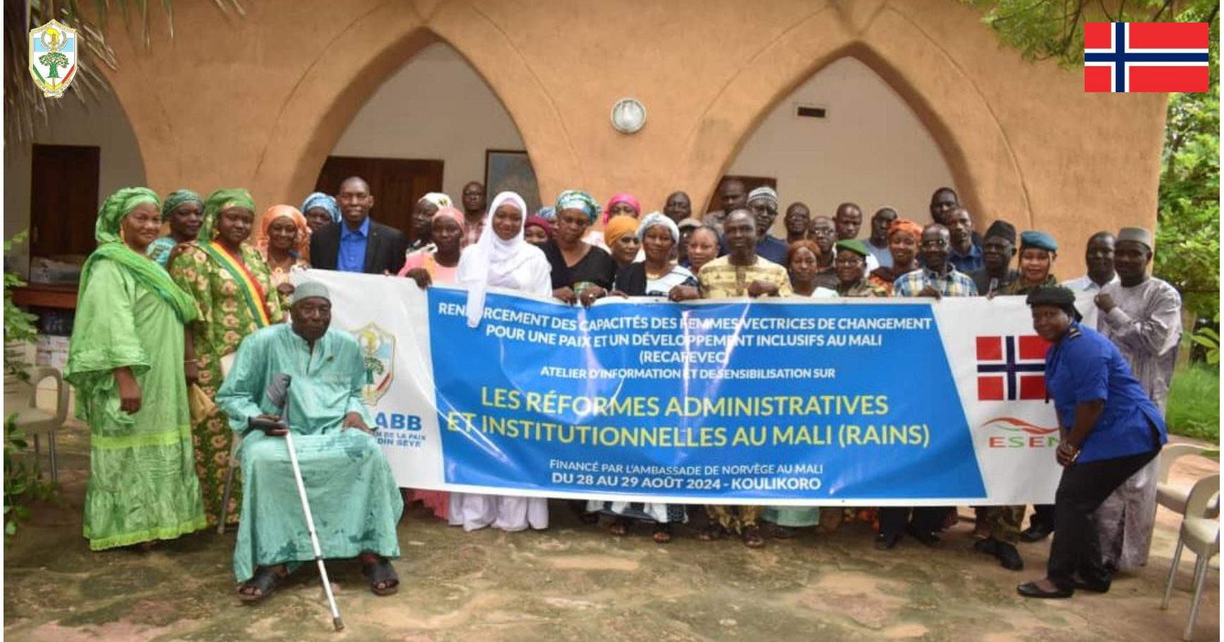
Administrative and institutional reforms in Mali - (RAINS) KOULIKORO 28 - 29 August 2024