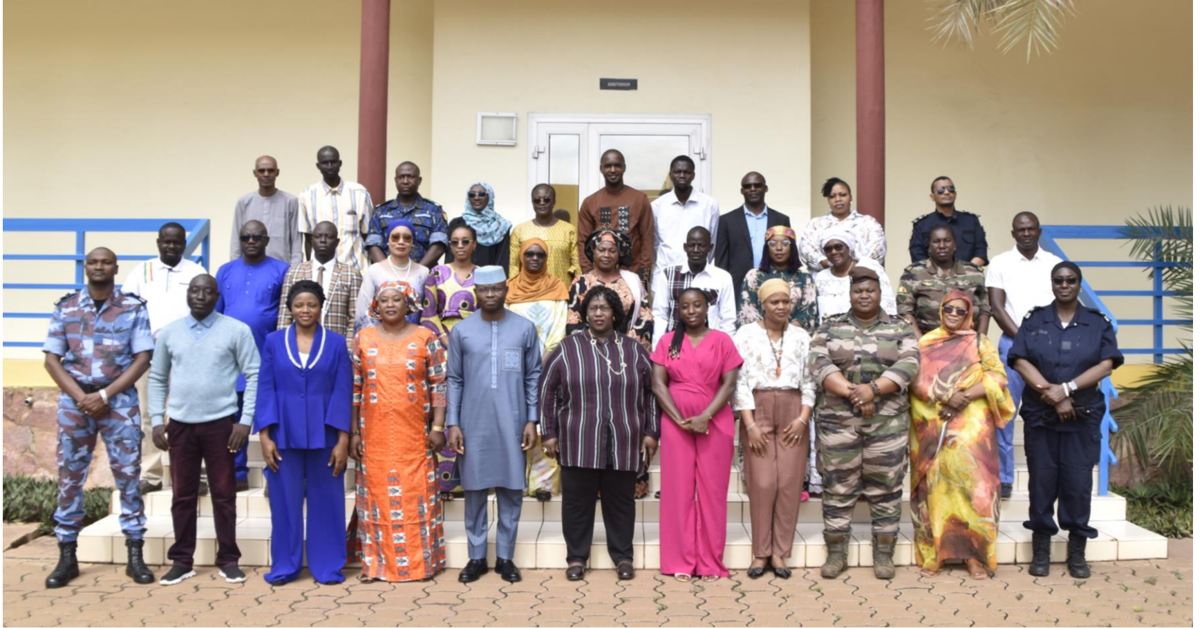
Gender Peace and Security (GPS 1-24) EMP-ABB 08 - 19 July 2024