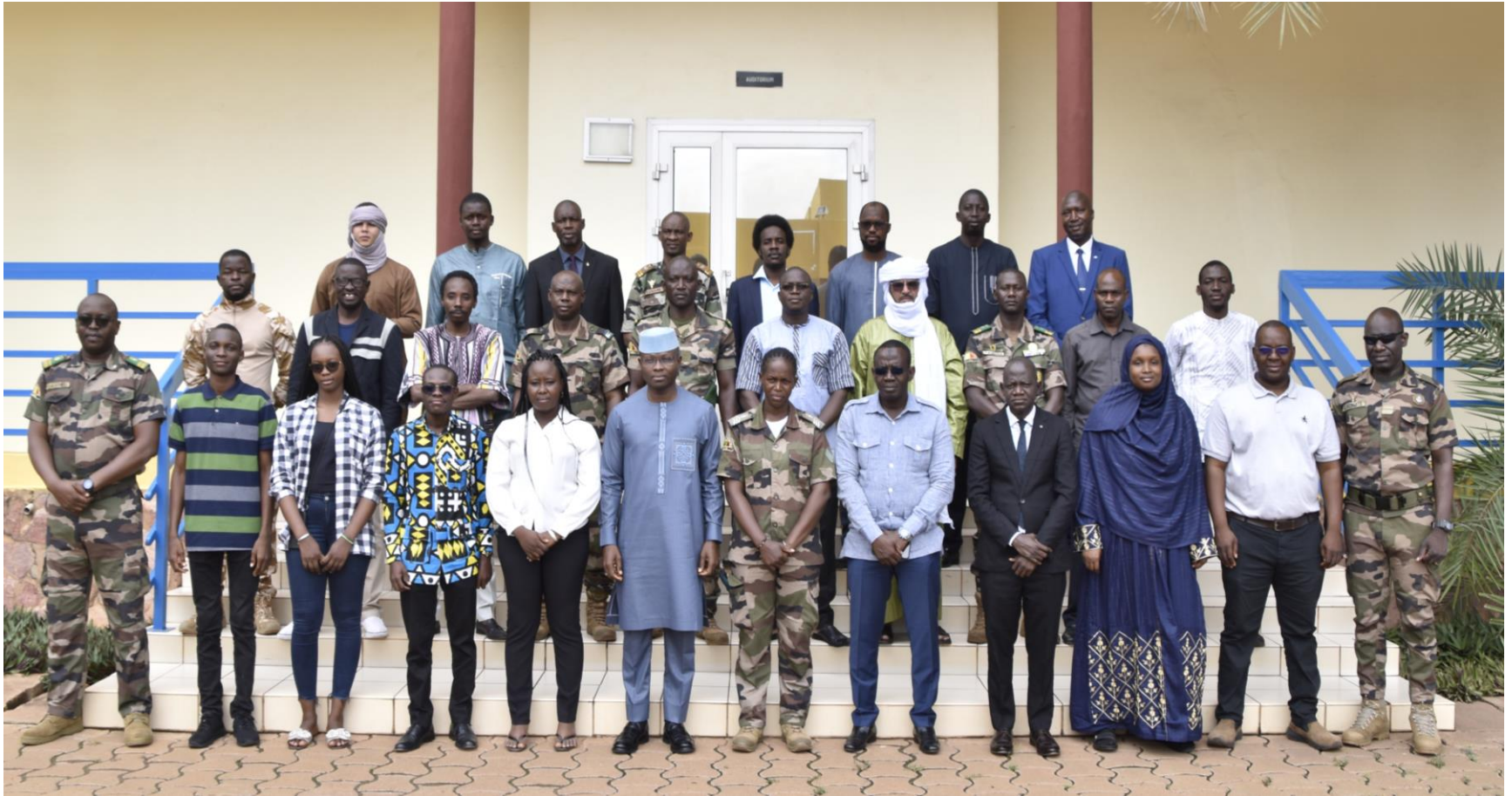
Transitional Justice (JT 1-24) EMP-ABB 08 - 19 July 2024