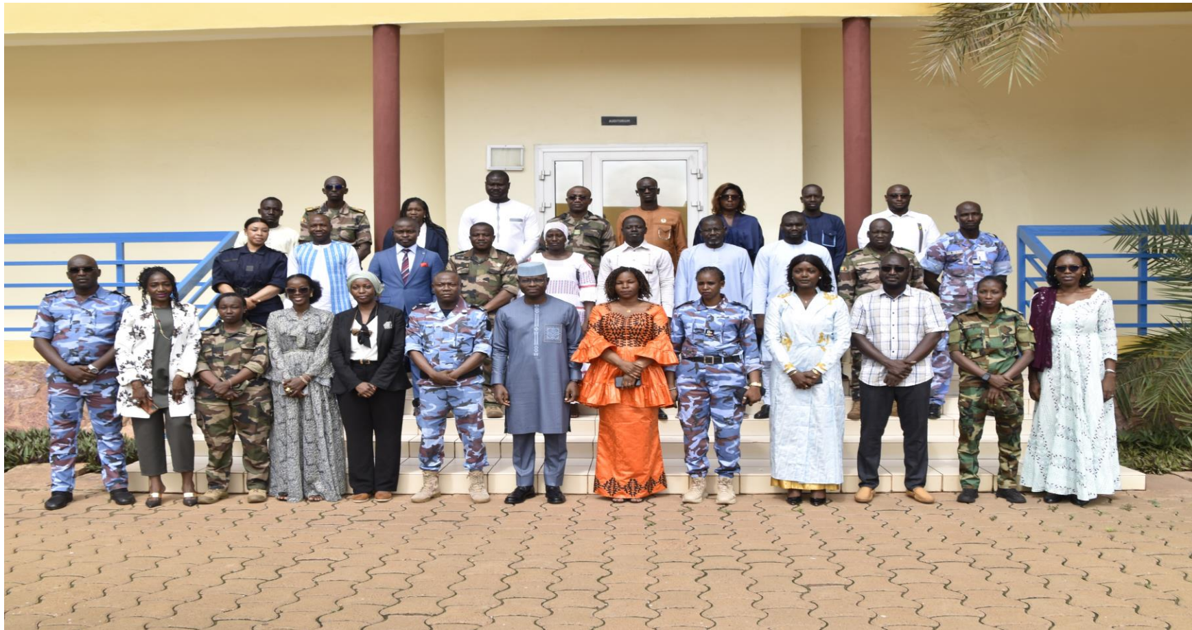
Human Rights and Gender in the Prevention and Fight against Violent Extremism and Terrorism (DHG-PLEVT 2-24) EMP-ABB