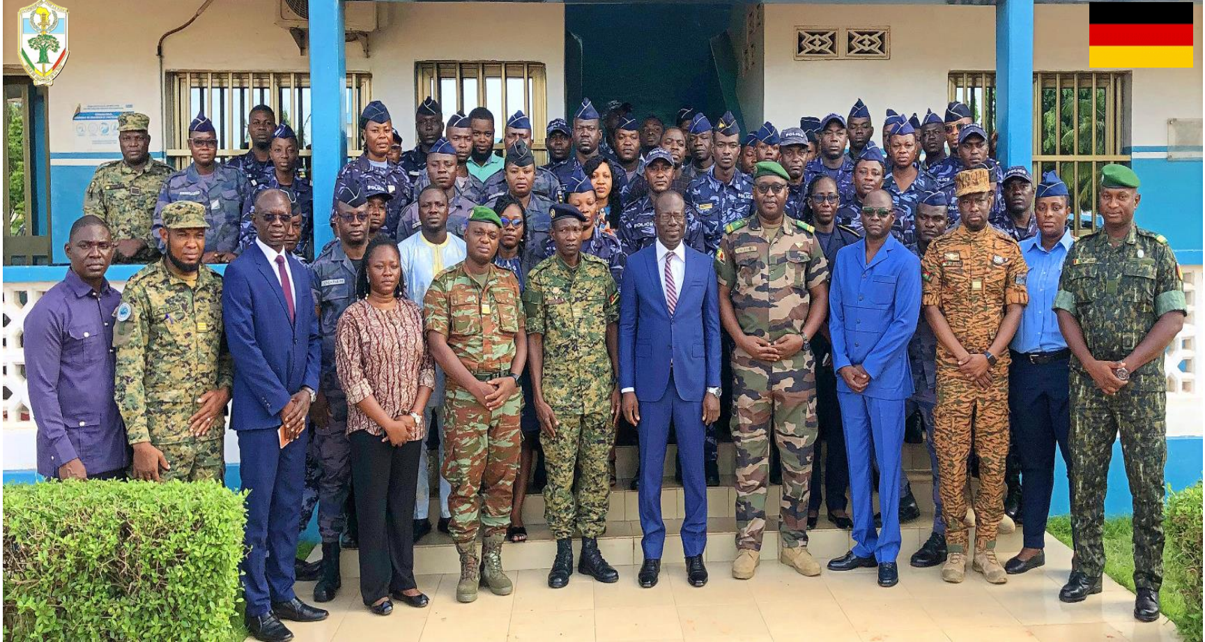
Logistique des Nations-Unies UNLOG 1-24 Lomé-TOGO Du 03 au 14 Juin 2024