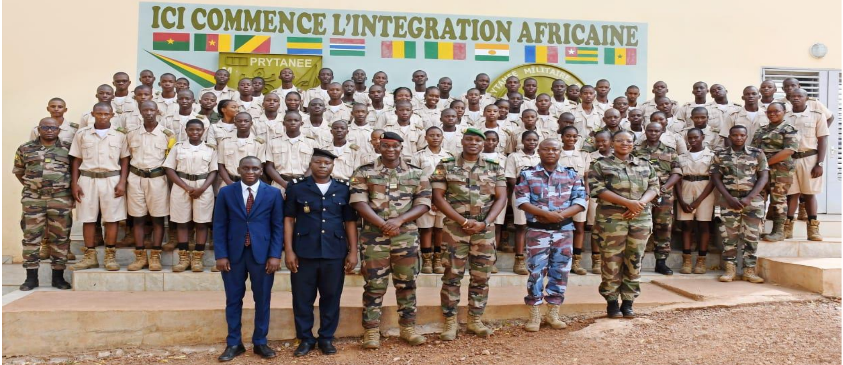
Droit International Humanitaire 4-24 Prytanée Militaire de Kati Du 03 au 07 Juin 2024