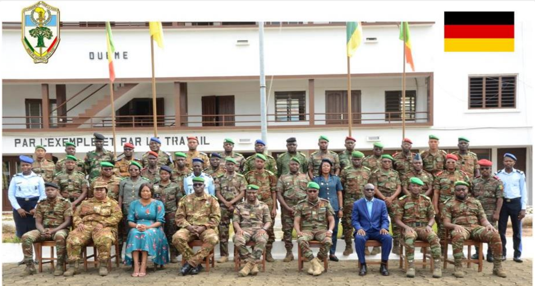
Coordination Civilo-Militaire des Nation-Unies UNCIMIC 2-24 Cotonou-BENIN Du 03 au 14 Juin 2024