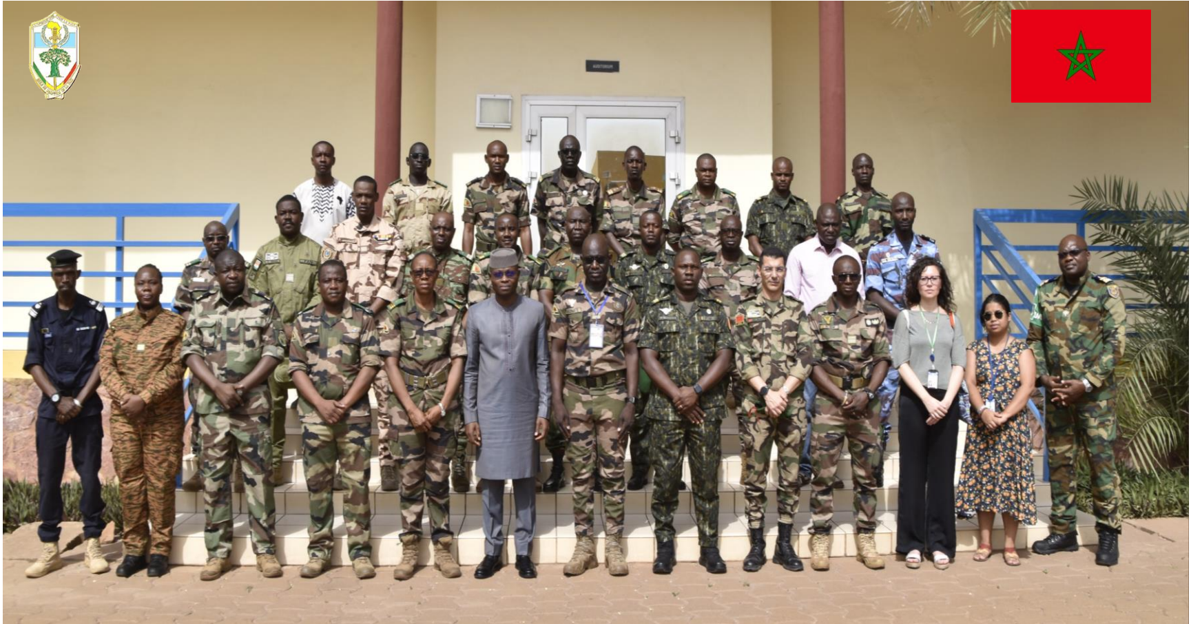
Formation des Officiers d'Etat Major des Nations-Unis– UNSOC 1-24 EMP-ABB